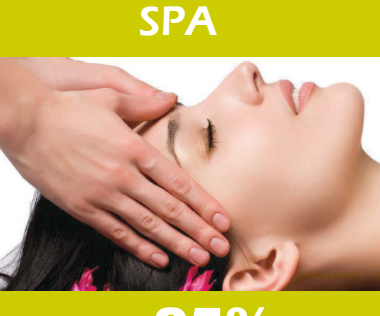
Up to 25% off