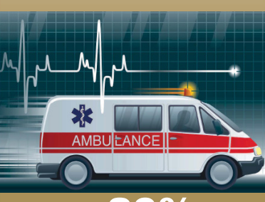
Up to 20% off