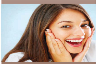
Up to 50% off